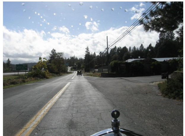
The Beautiful drive home