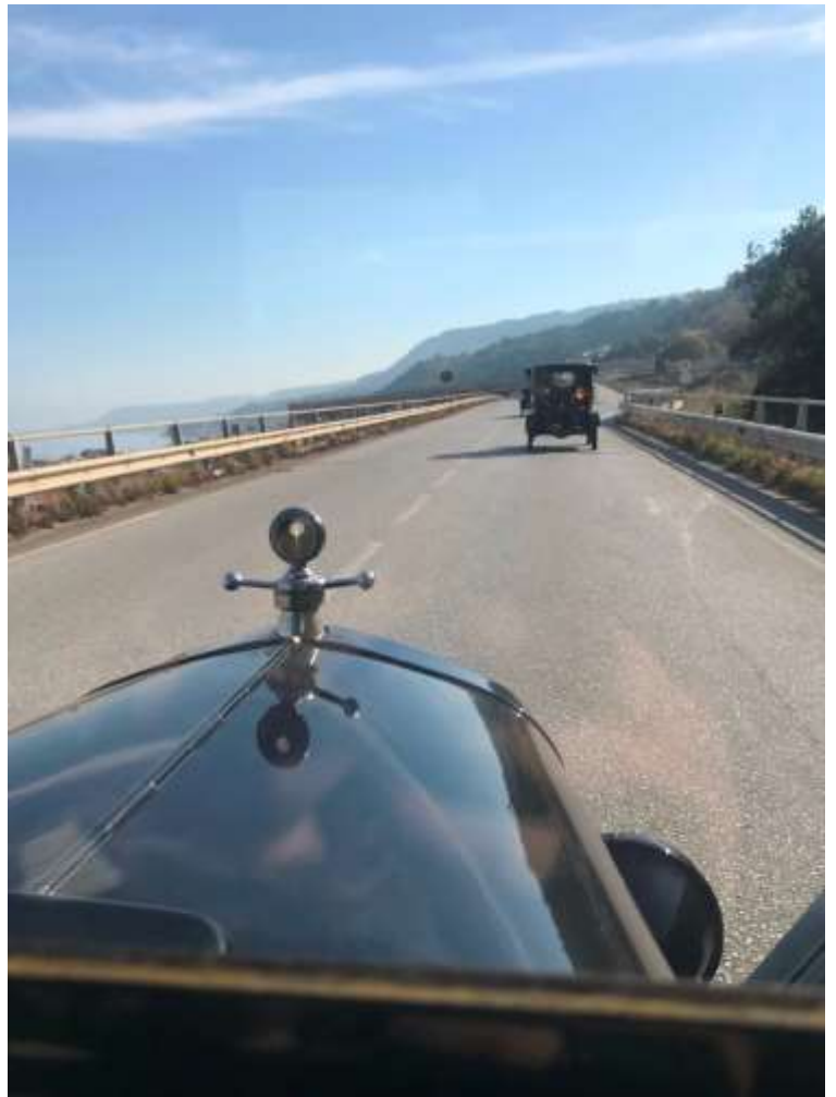
Beautiful Ocean Views.