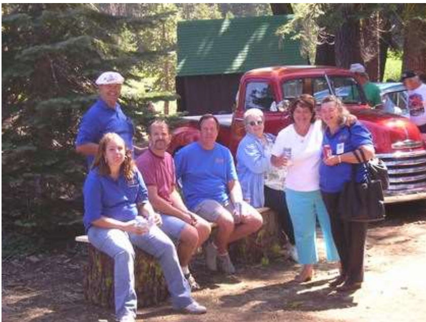
Robinson Flat Tour – Aug 2005