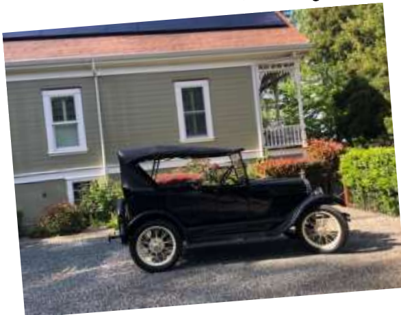
Historic Home Tour