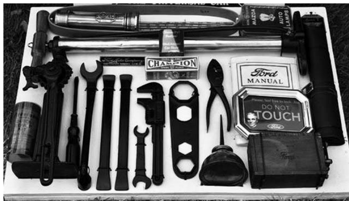
Another Original Ford Tool & Parts Kit