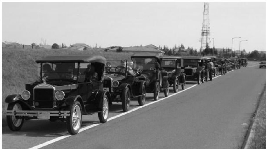
Shakedown Tour 2012