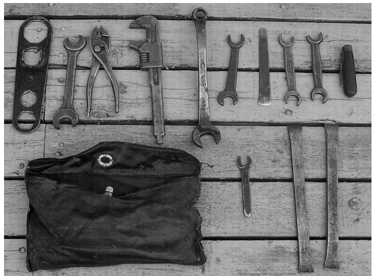
An original Ford Tool Kit

Socket set. Wrench set. Screwdrivers, flat and Phillips. Vise grips. Side cutter pliers. Hammer. Adjustable "Crescent" wrench. Band wrench. Electrical test light. Jumper wire w/alligator clips.