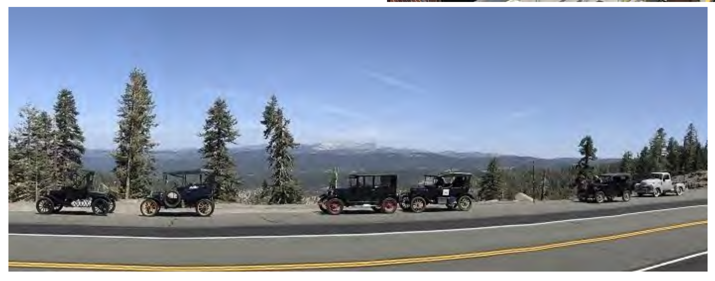
Photo Below - Group shot at the Heavenly Ski Resort parking lot as we left Tahoe.