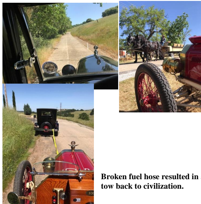
Broken fuel hose resulted in a tow back to civilization.