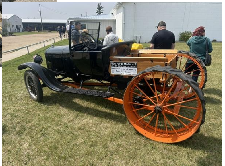
Model T Form-a-Tractor.