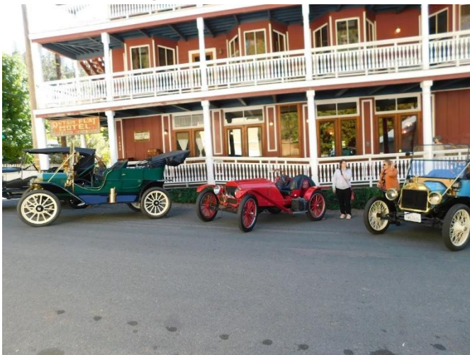
From tour June 2021

We are touring to the historic town of Dutch Flat. We will be having lunch in the recently opened restaurant inside the hotel. Arrangements are being made to have parking on the street in front for a photo opportunity. We will meet at Raley's at 9:15, leaving at 10:45. Lunch at 11:30. Sign up at the next meeting.