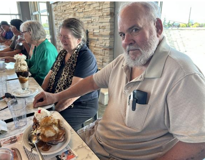
More Tour Pictures