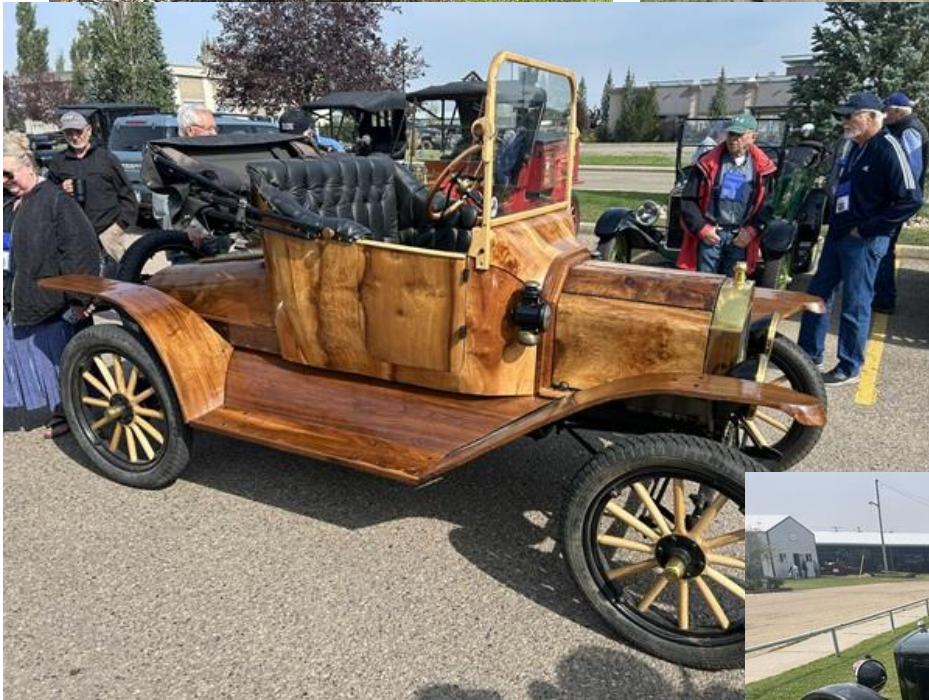
4 Model Ts got to ride on the train.