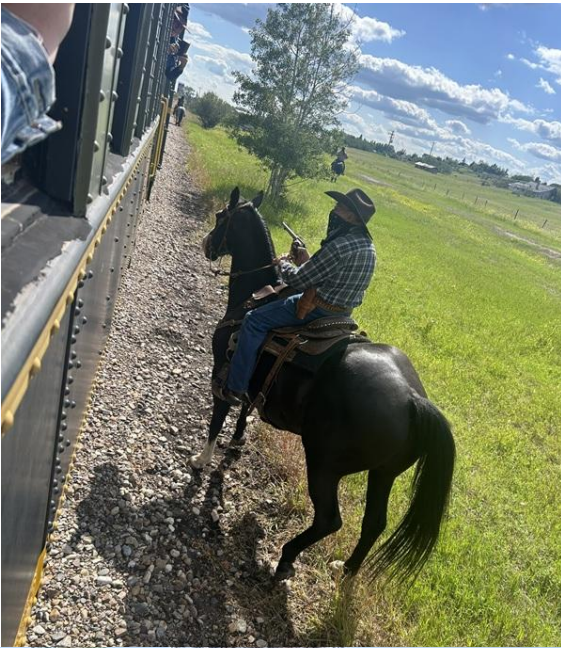
The “Hold-up on the train ride.”