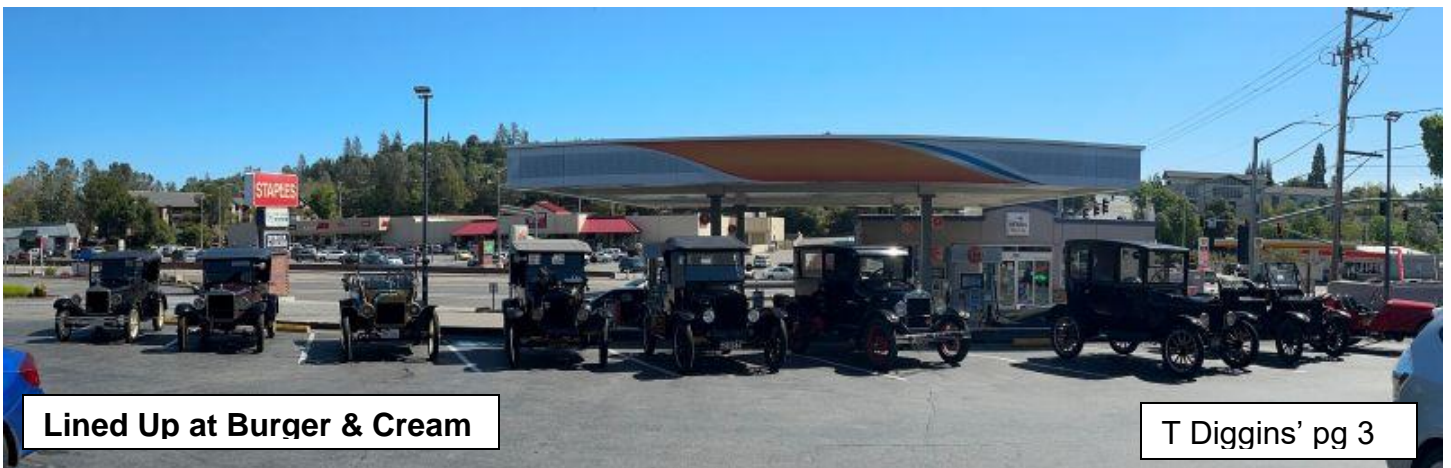
Lined Up at Burger & Cream