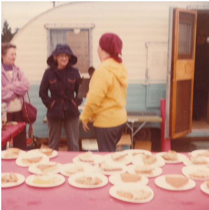
Home Made Pie- 1983 Swap Meet

See more info in The Vintage Ford Magazine.