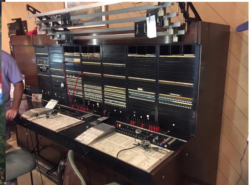
Typical Manual Switch Board