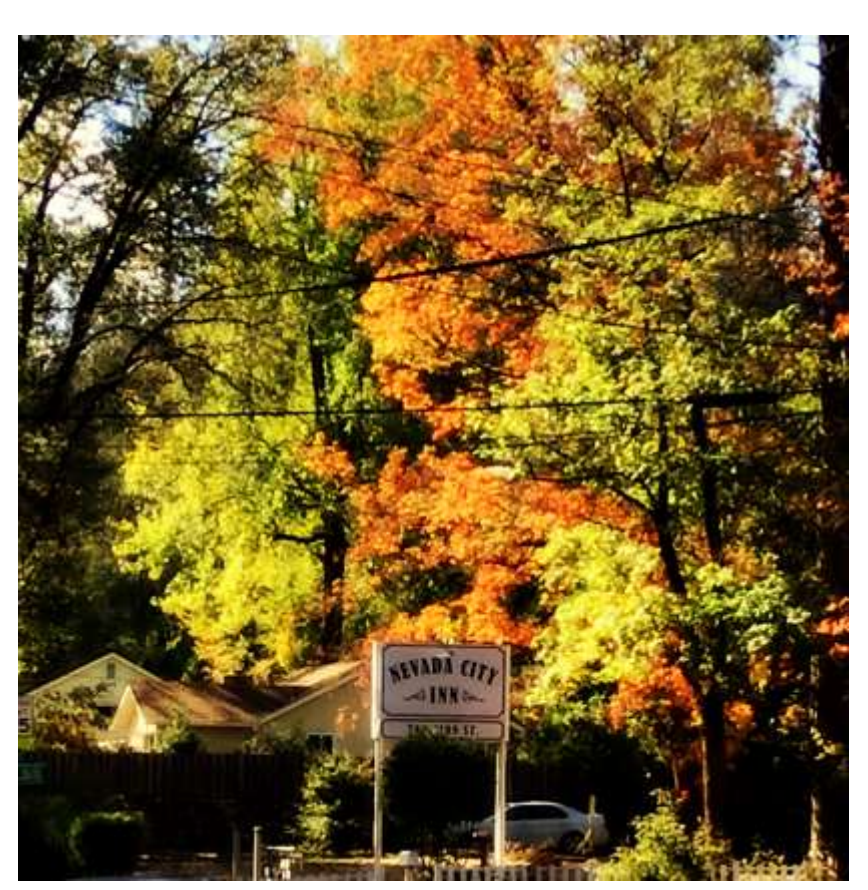
From last years' Fall Colors Tour.

We are still looking for a leader for this year.