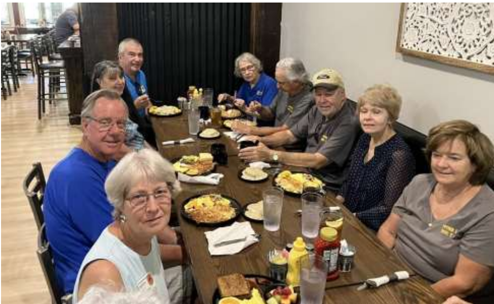
Our group enjoying breakfast

Remember you can view all the tour photos on our web-site.