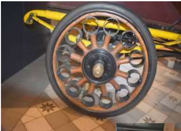
Very unique wheel