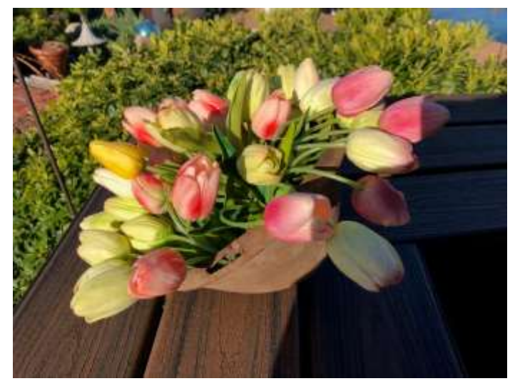
An old rusty headlight with beautiful spring flowers was a fitting table center piece.

I was the only charter member there this year. Hopefully, more will be able to attend next year. Hope to see you all at the Shakedown tour in April.