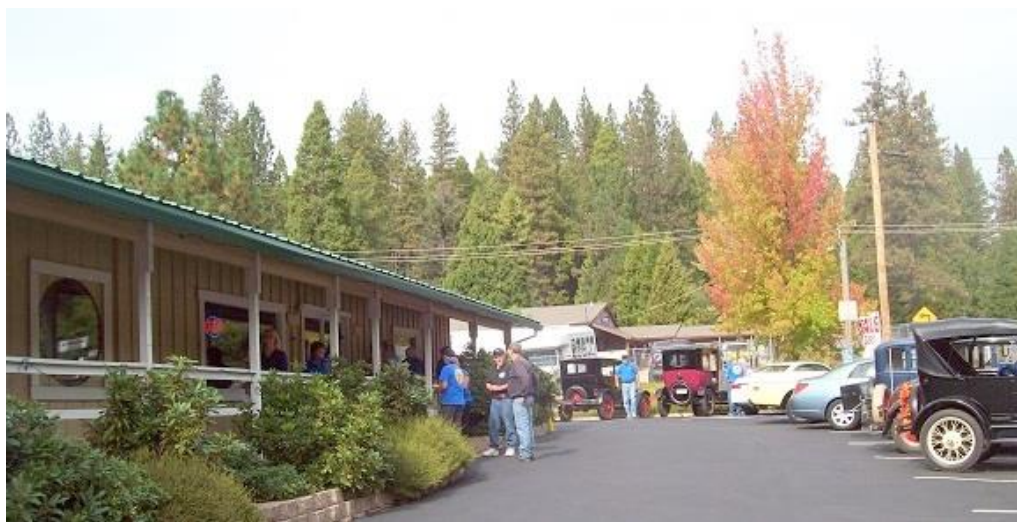
Fall Colors Tour – Oct 2015