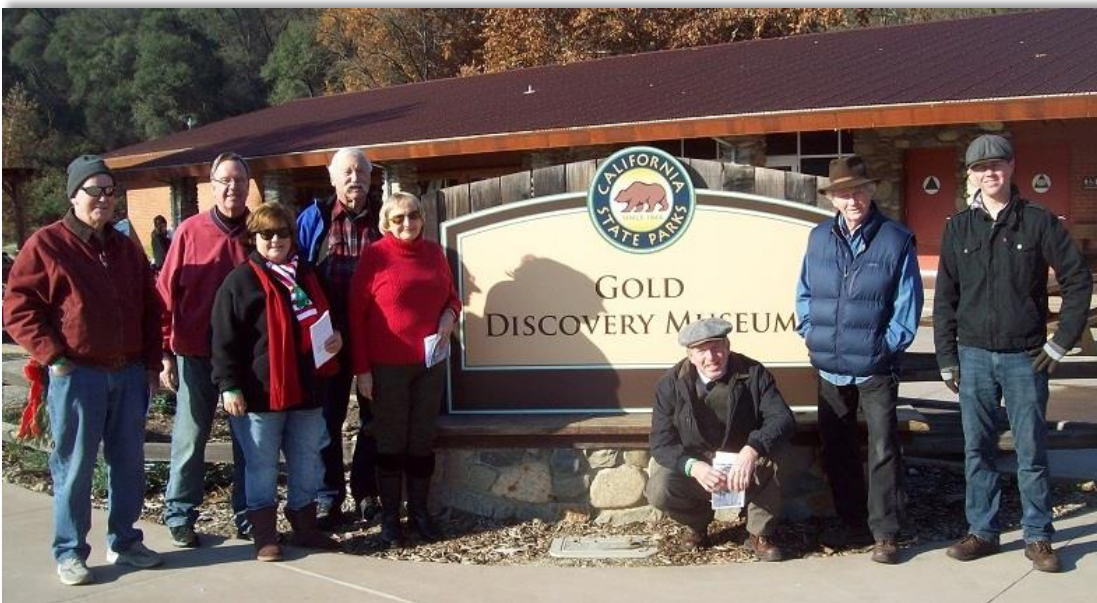
Coloma Holiday House Tour