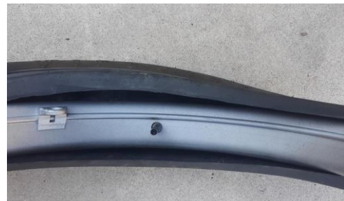
Photo 4 - Press the wheel into tire