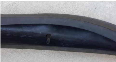
Photo 3 - Spread the bottom open wide