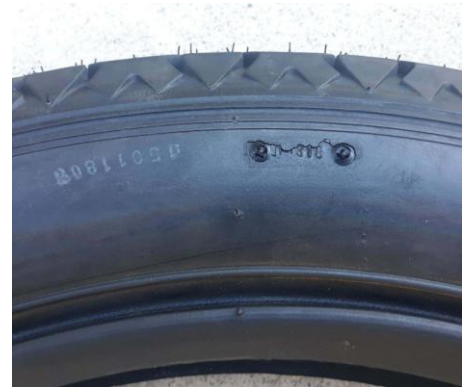
Serial Number on the back side