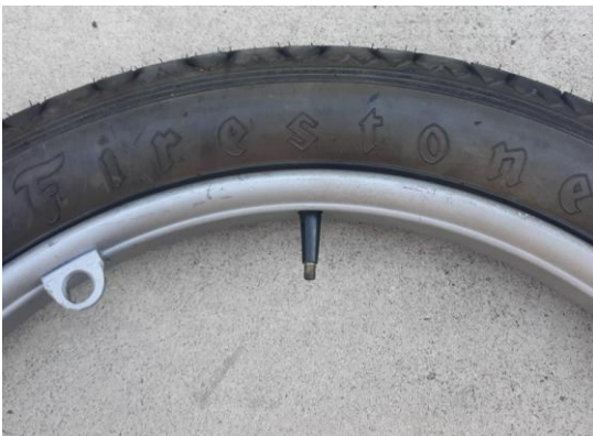
Photo 1 - Valve stem centered on Brand

Once both sides of the tire are mounted on the rim, you can start to inflate the tire. It's always a good idea to bounce the mounted tire on the ground a few times to help seat the bead in the rim. When both beads are seated, you can fully inflate the tire. As you may remember from previous articles, the clincher tire is a high pressure tire. The formula for inflation is 18 to 20 pounds pressure per inch of width. With that in mind, a 3-inch wide tire should be inflated to between 54 to 60 pounds per square inch. A 3 ½ inch tire should be inflated to between 63 to 70 pounds per square inch. By inflating your tires to the proper high pressure many tire problems can be avoided.