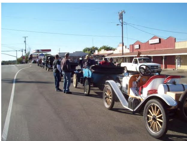
Rest Stop in Cool