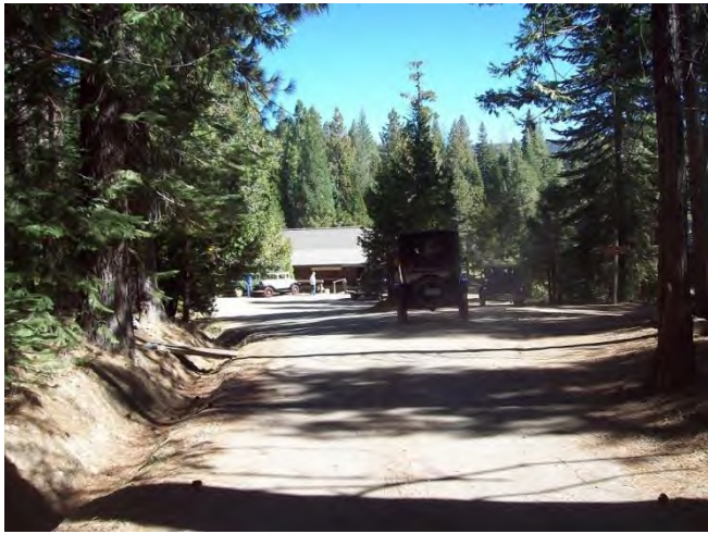
Coming into Uncle Toms