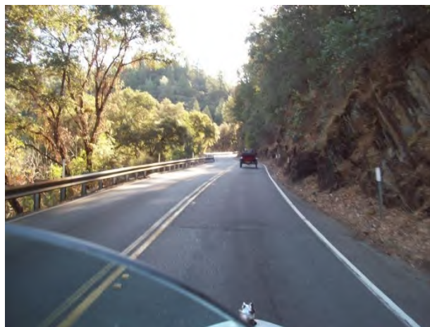
Heading down the Canyon