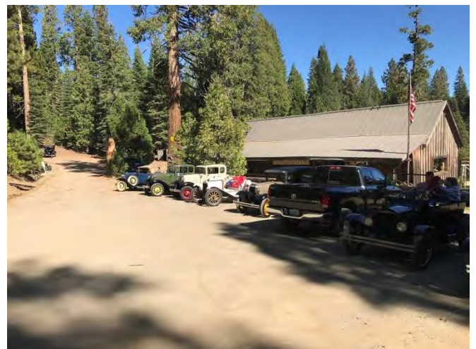
Let's do it again!