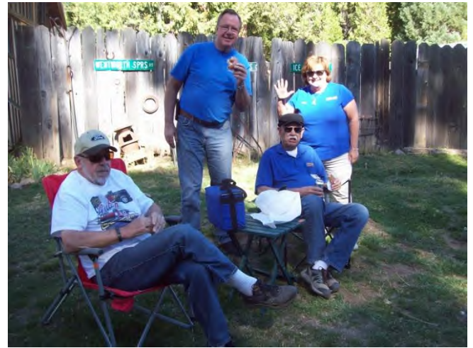
Relaxing and eating our lunch