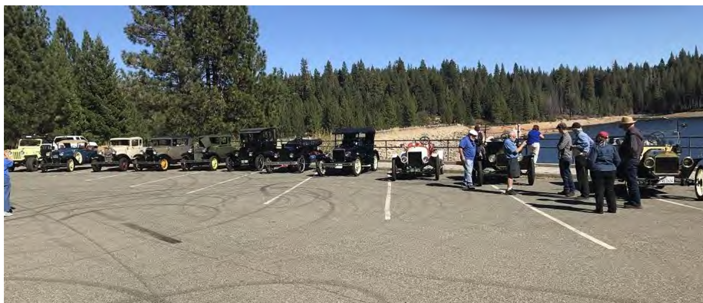
Regrouping at Stumpy Meadows.