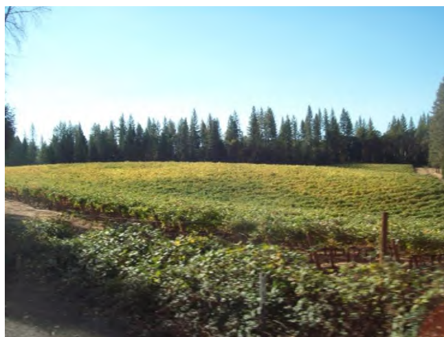
Vineyards on Spanish Dry Diggins Rd.