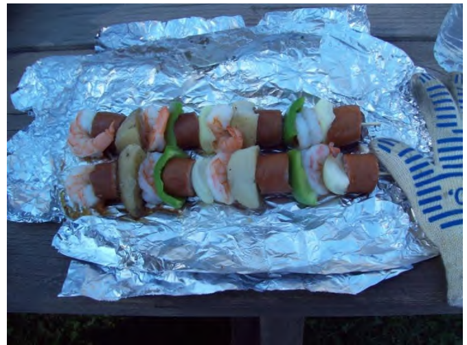
Manifold cooking at its best -Yummy