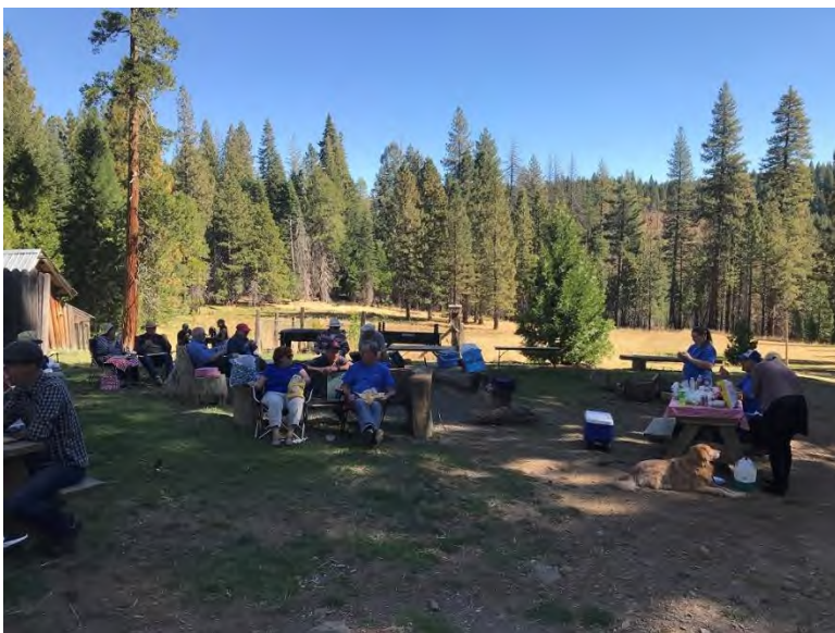
There is plenty of room to spread out and practice social distancing.